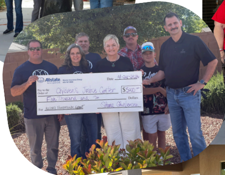
Allstate: Shonie Insurance Group