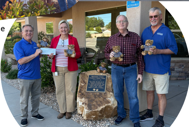
St. George Exchange Club