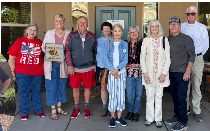
Shepherd of the Hills United Methodist Church